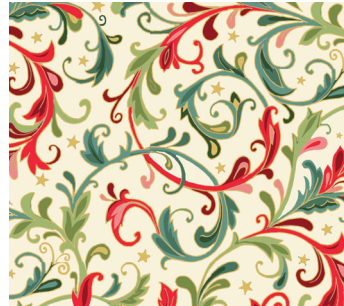
2373 Q Decorative Scroll