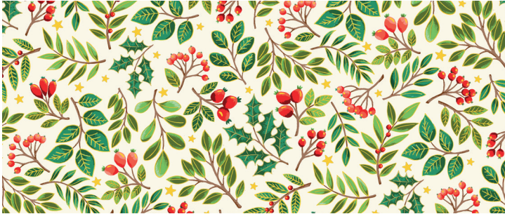
2375 Q Foliage Scatter