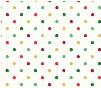
1948/Q2 Multi Spot