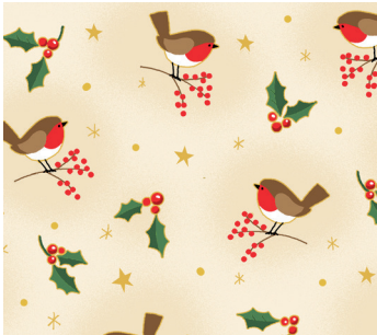
2376 Q Robins