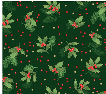
2377 G Holly Spray