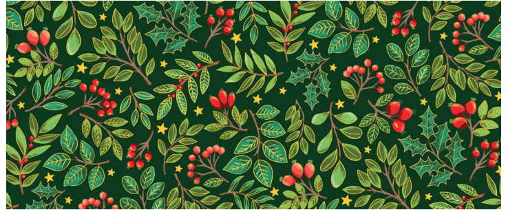
2375 G Foliage Scatter