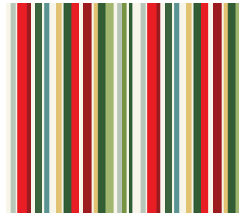
2203/G3 Straight Stripe