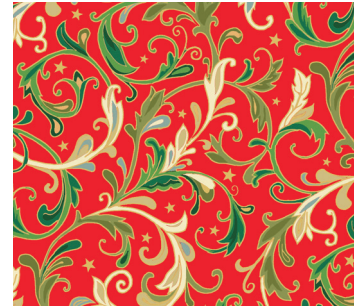
2373 R Decorative Scroll