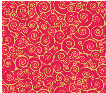
2182/R6 NEW Scroll