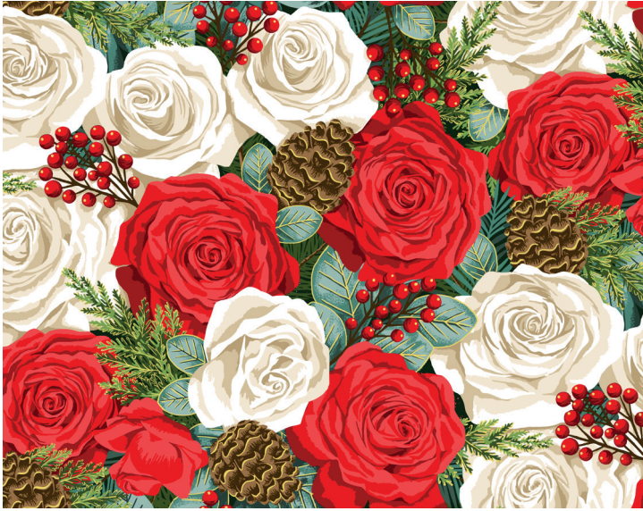
2371/1 Christmas Rose