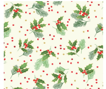
2377 Q Holly Spray